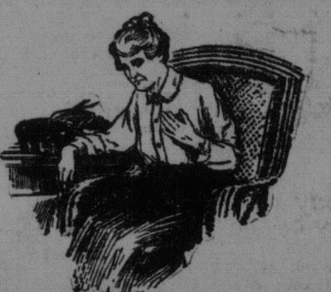
"I Am So Afraid It Is My Heart"