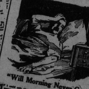
"Will Morning Never Come"