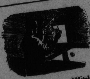
Workers in Chemicals and Metals Are Often Subject to Anemia