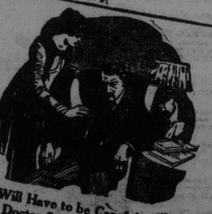
You Will Have to be Careful, Johnny, the Doctor Says Your Heart is Very Weak