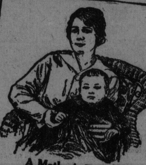
A Mother's Tribute