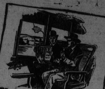
What Is This Nerve Food You See Advertised in all the Papers, Some Kind of Patent Medicine?