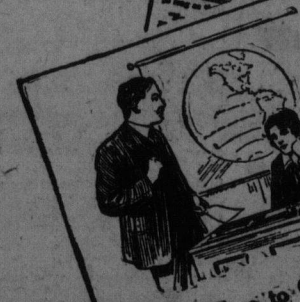
"I Shall Have to Quit, Principal, I Cannot Manage This Class"