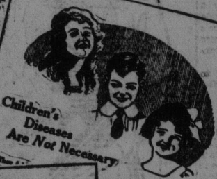
Children's Diseases Are Not Necessary