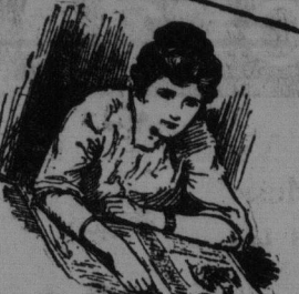
"I Wonder If It Would Help Me"