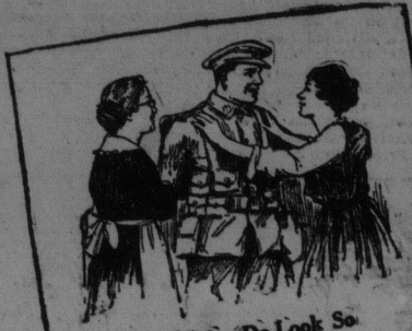
"Oh, You Do Look So Strong and Well"