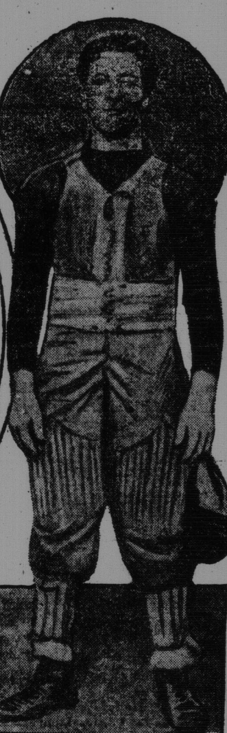
Gordon-Tackie Central High.