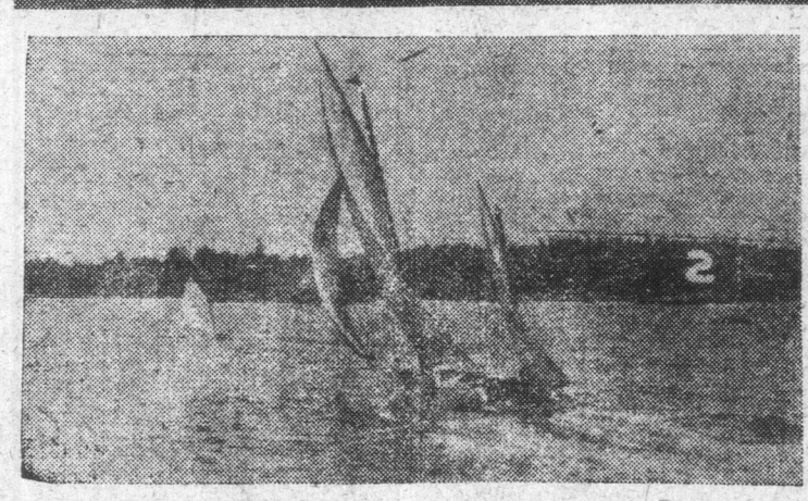
YAOHUING CARNIDAL. 1-Everett's Pride, "The Myth." 2-Homeward Bound