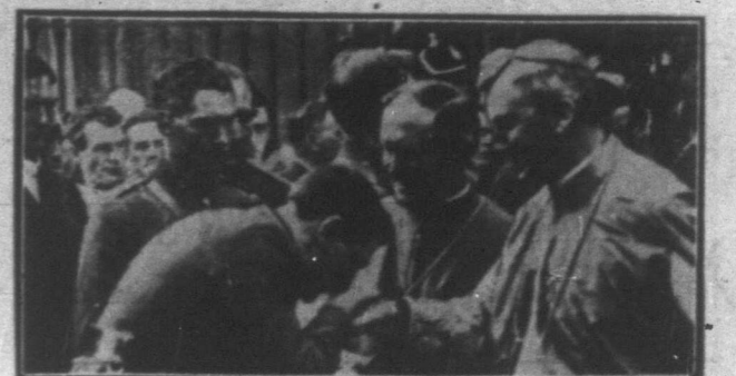
At Arthur Griffith's funeral in Dublin, Michael Collins kissing Archbishop Byrne's ring. And now Collins, too, is dead.