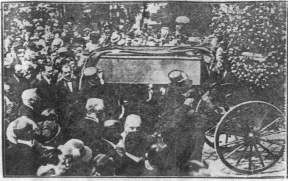
Funeral of Jules Guesde, socialist leader, in Pere-Lachaise Cemetery, Paris.