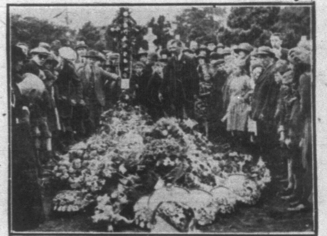
Arthur Griffith's grave in Glasnevin Cemetery, Dublin.