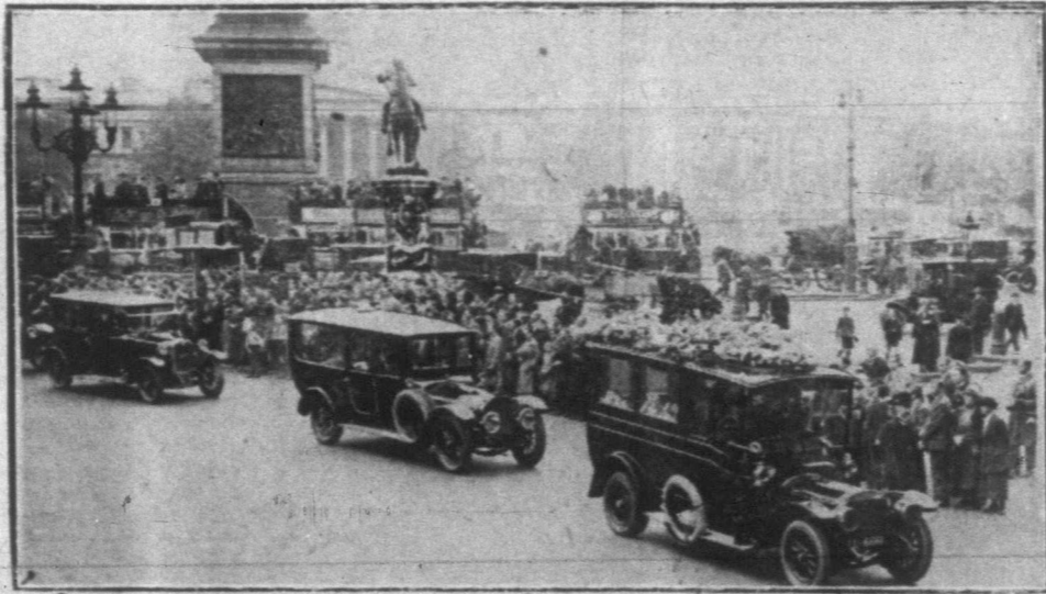
Funeral of Viscount Northcliffe passing Trafalgar Square.