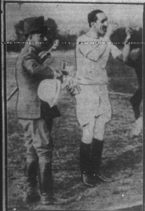
King Alfonso of Spain photographed after a polo game at Deauville, France.