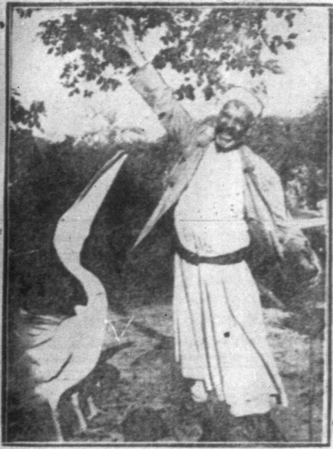
Feeding a pelican in Nourha Gardens, Alexandria, Egypt.