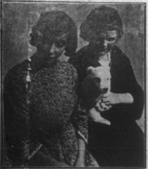
These girl stowaways with their dog were found on the S. S. Majestic.