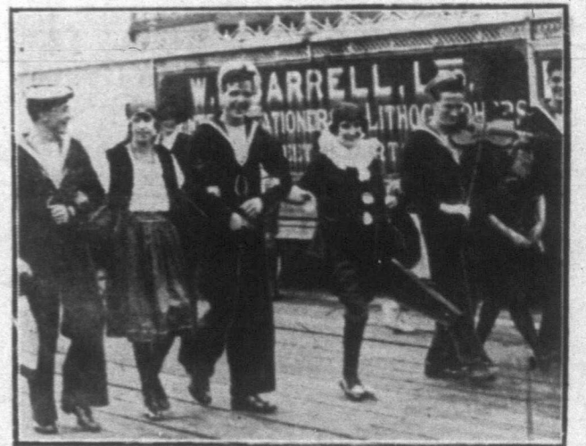
They had a carnival recently at Southsea, an English watering place, and the sailors didn't mind.