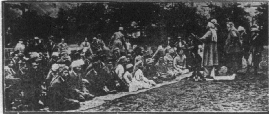
A number of Moslems are employed at Woking, England, and Mohammedan services are held for them.