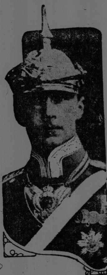
The former Crown Prince of Germany who wants to be a lecturer. He says he would like to start in the United States.

English Wife of Los Angeles Man Strikes Customs Snag While Red Tape is being Cut.