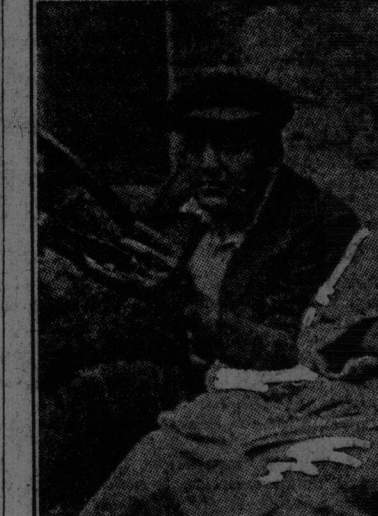
Another one of those Famous Gem Comedies

Two parts in today's chapter, entitled "The Crazy Auto Driver" in which Pauline undergoes further trials and adventures.