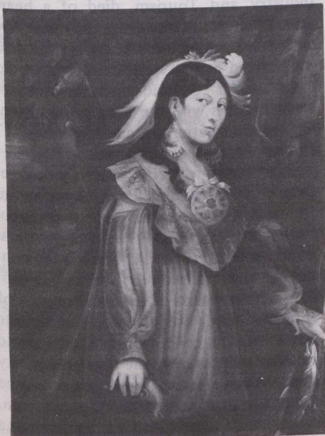
National Gallery of Canada

Légaré's dramatic series in five canvasses of the 1845 fires at Saint-Roch and Saint-Jean, Quebec City suburbs, which he painted to raise funds for the victims, have been brought together from the collections of lenders.