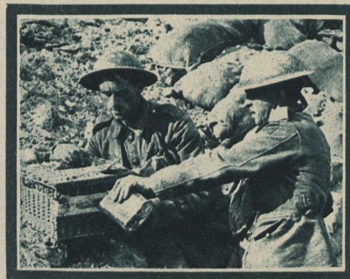
A little drop of water for the bird. Watering a carrier pigeon in a captured German trench.