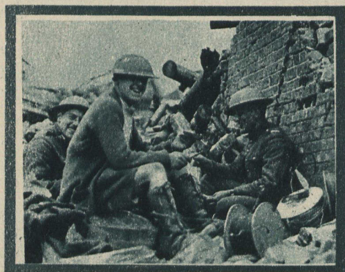
A picnic among the ruins of shattered German trenches on Hill 70.