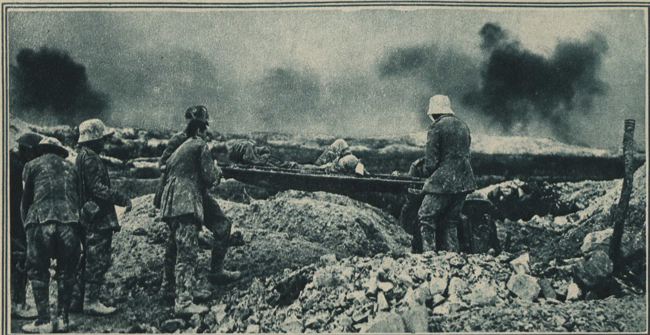
After the Canadians had captured Hill 70, the Germans made an abortive counter-attack. These wounded and captured Germans are waiting for the "strafe" to cease before proceeding to the Canadian rear.