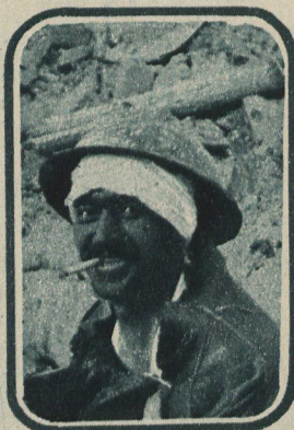
Wounded but smiling, he smokes his cigarette.