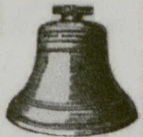
ST. GEORGE'S CHURCH MONTREAL, BELLS.