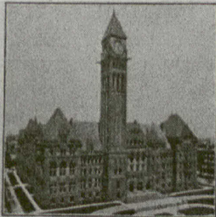
TORONTO CITY HALL CLOCK.

Catalogues will be forwarded to Architects and Building Supply Houses in Canada on application.