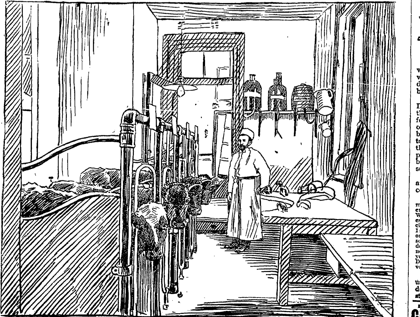
Scene in the Interior of Vaccination Institute.