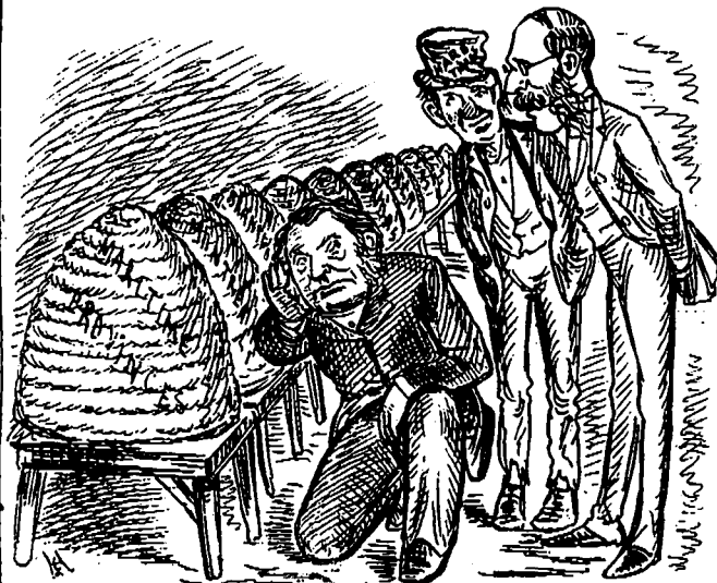
A HUM, FOR SURE!

SIR DICKEY.—Yes, of course you hear a "hum;"—that arises from a want of honey in the hives, though.