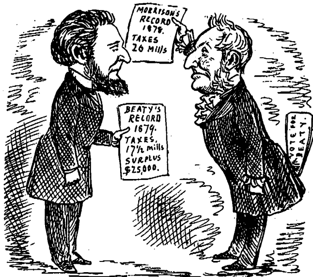
WHO'S THE BEST MAN FOR MAYOR?

SIR DICKEY.—Yes, of course you hear a "hum;"—that arises from a want of honey in the hives, though.