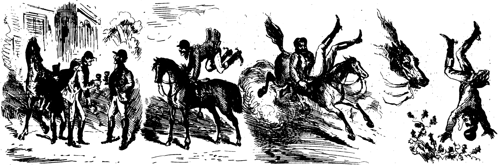
The Jumping Powder, when taken in this form, 2 Causes a great elevation of animal spirits, 3 Followed by more serious consequences, 4. Terminating in a most lamentable catastrophe.