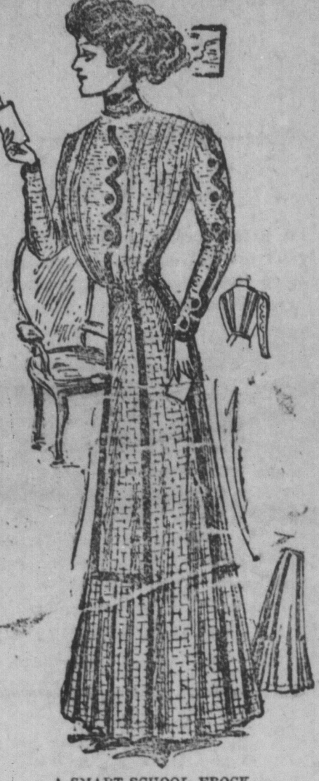
A SMART SCHOOL FROCK.

Materials Are to Be of Dull Finish in the Fall. It is predicted that dull finished fabrics are to be used for the smartest frocks in the fall. This is a radical change from the lustrous effects which have been worn all summer. It is rumored that long coats may have their popularity challenged in the near future by the Russian blouse, for signs are not lacking that this old time