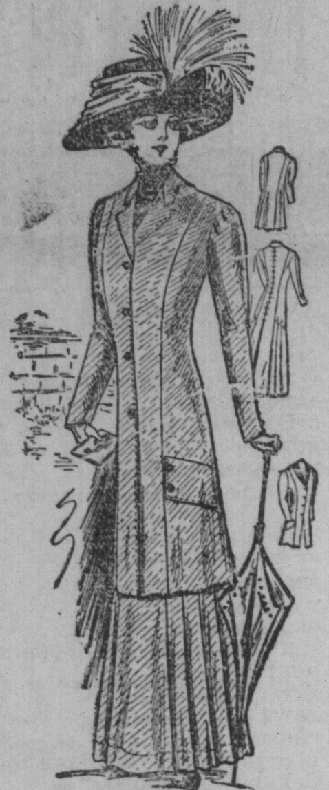
THREE-PIECE SUIT FOR FALL.

The Fat Woman and the Quirass Effects Do Not Agree. A funny sight these days is the fat woman in a princess trotting frock of curass effect clinging tightly around the hips and perhaps halfway to the knees, where it forms a founce or plaiting. It is a sight to make the angels weep, and yet fat women will wear these frocks. Peasant chemisettes in sheer soft mull or batiste form the upper part of the bedlows in some good short frock models. These are usually associated with a skirt and high peasant girde or with one of the little princess frocks. The chemisette is really the whole bodice. It is a round neck, about which the soft, thin material is shirred, and the fullness droops slightly over the girde or frock top. A new coat which is likely to