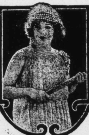
Marion Davies in the Paramount Picture "Beauty's Worth"

A Captivating Comedy of the victory of charm over snobbishness.