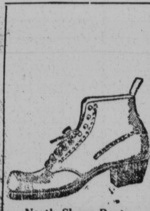
North Shore Boots style 1762

Every Vote Counts--- Boost Your Favorite