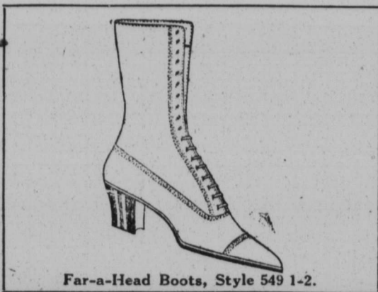
Far-a-Head Boots, Style 549 1-2.

Lumbermen's Supplies, Rubbers, Moccasins, Mackinaws, Shoe Packs, Sweaters, Underwear, Dry Goods, Men's and Women's Wear, Boots and Shoes.