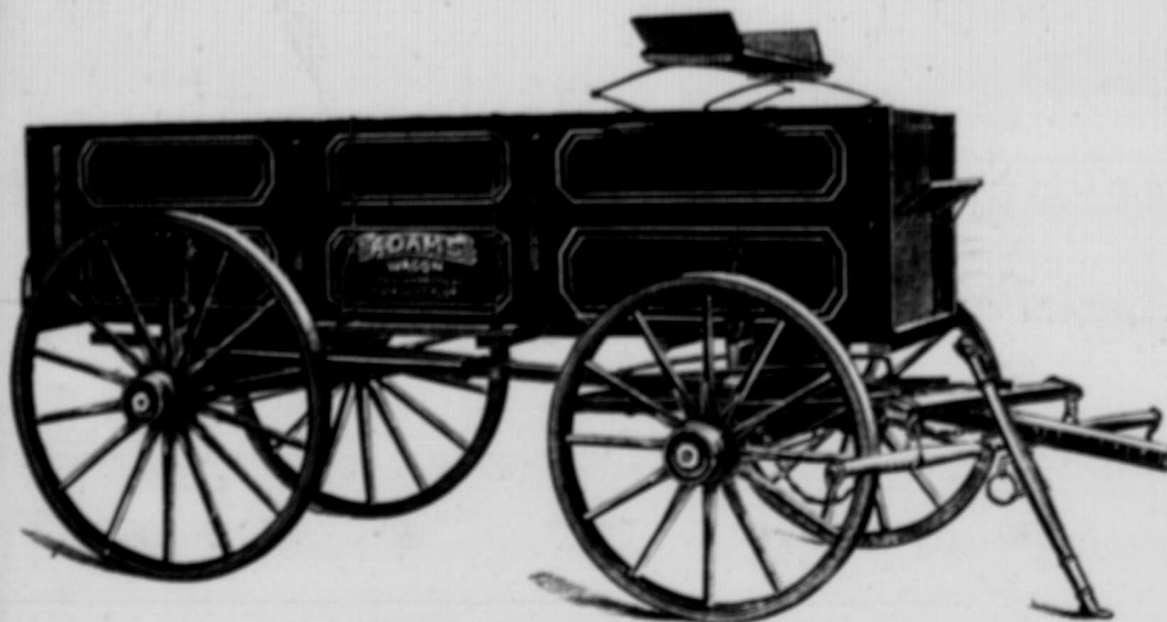
Adams Standard Wagon

The Adams Wagons are made especially for us and are warranted by us. We know from actual inspection during manufacture that nothing but the very best selected wood stock, thoroughly seasoned, goes into their construction.