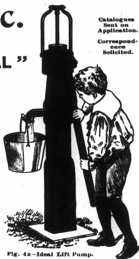
Fig. 4x—Ideal Lift Pump.

GOLD SHAPLEY & MUIR CO. LIMITED BRANTFORD CAN.