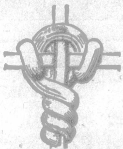
The FROST "hold-tight lock"

better than the ordinary wire fences because, in the first place, it is made from Canadian-made wire, specially tempered and galvanized in our own wire mills to suit our rigorous Canadian climate. Secondly, it is woven more slowly than other kinds of wire fence and on improved lines of construction, which result in having every horizontal exactly the same length and every upright perfectly straight and evenly spaced. Note also the Frost tight lock. No other wire lock has yet been produced which can equal it in neatness and security of holding.