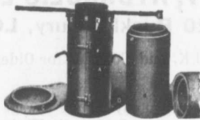
Moulds and the Tile they make.

SAWYER & M'ARSEY CO., Limited Hamilton, Canada.