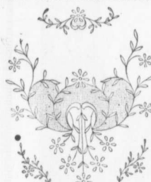
640 Design for Embroidering a Blouse Front, Collar and Cuffs. The background can be worked in Rhodus or Punch work or in French Knots

Designs illustrated in this column will be furnished for 10 cents each. Readers desiring any special pat- tern will confer a favor by writing Household Editor, asking for same. They will be published as soon as possible after request is received.