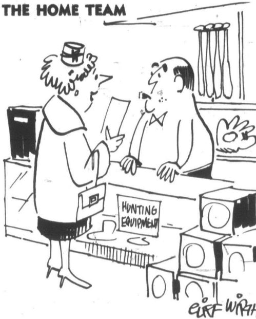
"Have you a bat that hits nothing but home runs?"