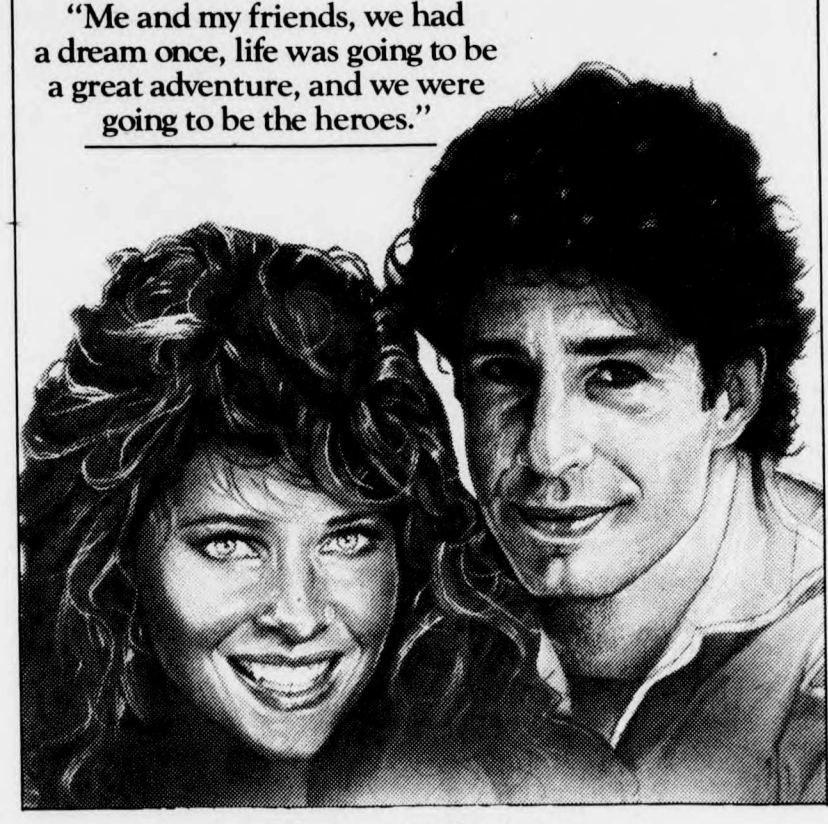
The dream is alive in the...

Free Delivery in the Metro Area with this coupon Offer Expires September 30, 1984