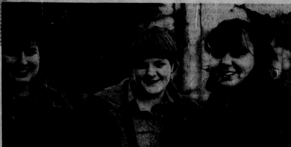
PERTH PEOPLE BSc & BBA "Alladin, Mickey Mouse and Quasi Modo."