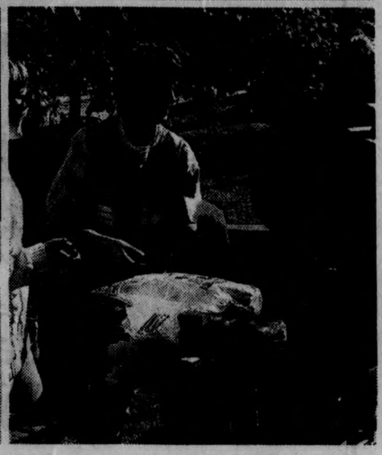
An annual event of thrills and spills, high speed chases, but no Roscoe P. Coltrane. The Student Society for Mechanical Engineers runs the Coaster Derby where teams of students design and build a gravity-driven vehicle to plummet to their certain demise at the bottom of the perilous College Hill. No casualties (were reported) and fun was had by most of the people who survived the SSME BBQ.