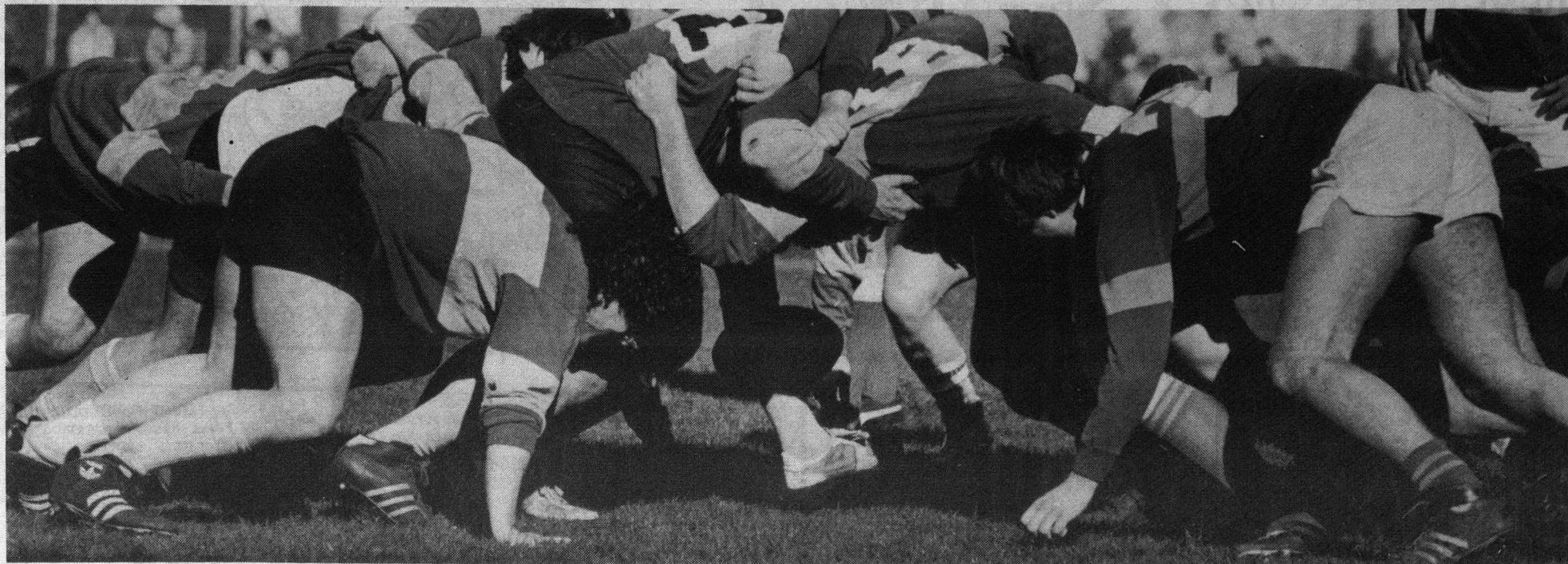
Things get pretty crowded inside of a rugby scrum. U of A beat the U S College champs during a recent tournament in Victoria.

With a squad of 37 players, most of whom had never played together as a team, the University of Alberta Rugby Club set out for the University of Victoria Invitational Rugby Tournament.