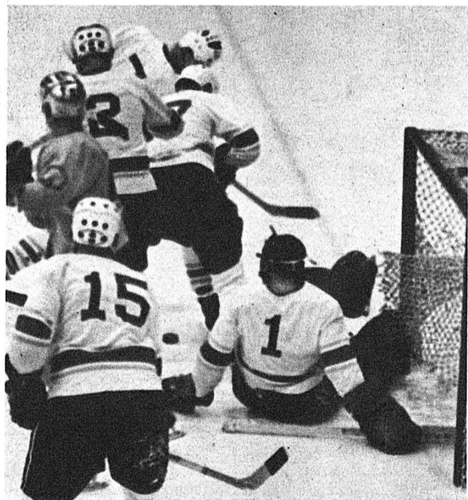
SOME DAYS NOTHING GOES RIGHT ... caught sitting down on the job

A look at the past year's successes and failures in basketball, hockey, and football