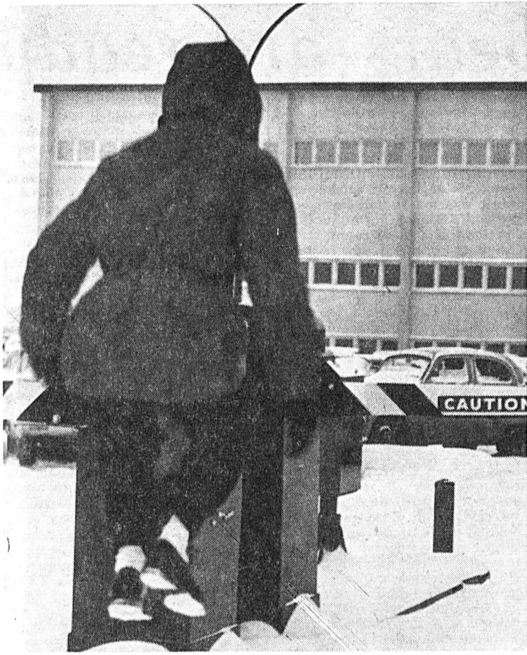
NUMBER ONE in a Gateway How-To-Do-It series. This week, Gateway surveys current trends in cheating at the game of Beating the SUB Parking Lot Pay Gate. Method one: drive car to gate, get out, run around behind gate and jump on the treadle which opens the gate free to traffic entering the lot. Run back to car and drive out before gate closes.