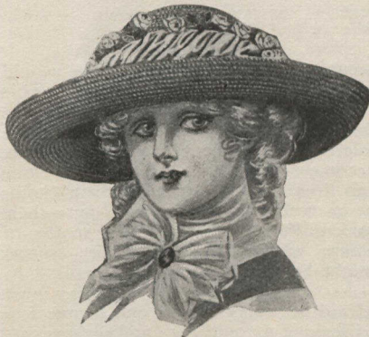
A PRETTY APRIL HAT

HATS are still the objects of special feminine interest and observation, and the new models are carefully studied and copied by those anxious to keep up with Dame Fashion's vagaries. The one illustrated on this page is an Eaton sample, a charming hat for misses, a most becoming shade of fancy straw braid, with dome crown and roll-