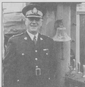
Portrait of Henry Larsen aboard St. Roch, 1944.