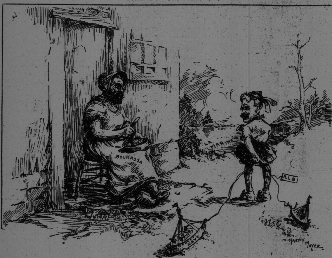
Henri Bourassa as mother peeling potatoes, and R. L. Borden as little girl dragging a couple of ships labelled "Navy" toward water labelled "La Marine."