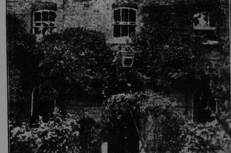
The police station at Epsom, Surrey, England, after the recent fatal riots in which Canadian soldiers participated.