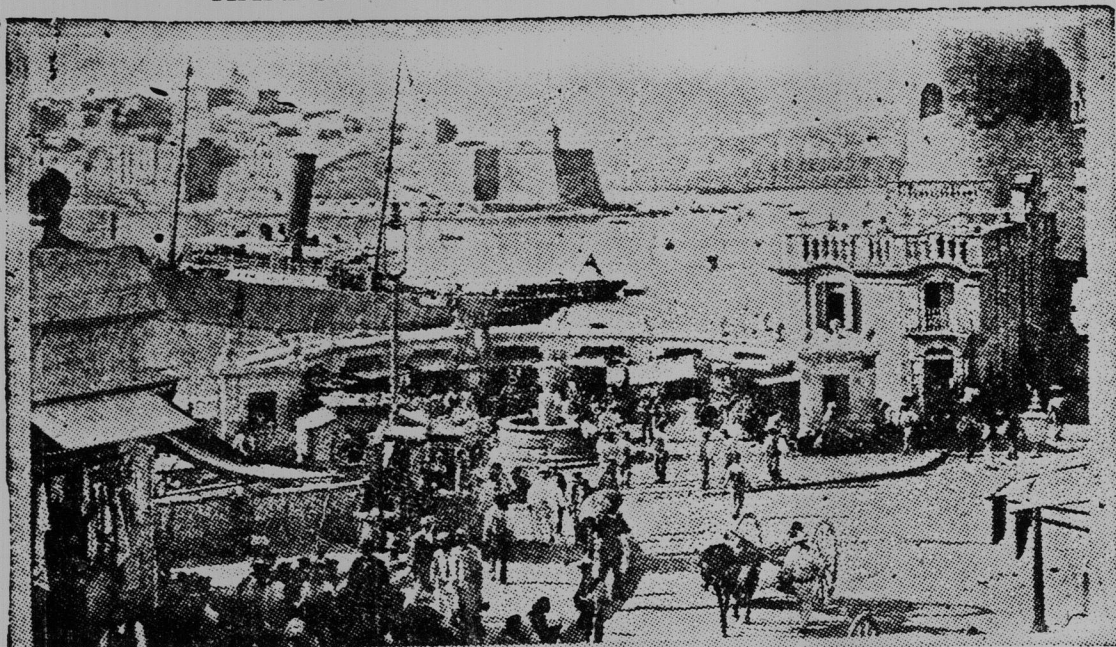
Great Britain has conceded local self-government to Malta and the city of Veledda indulged in an excited celebration for three days. During the war 200 hospital ships had their headquarters at this great fortress.

To Be Under Supervision of Secretary of Commerce—President's Special Board Prepares Legislation.