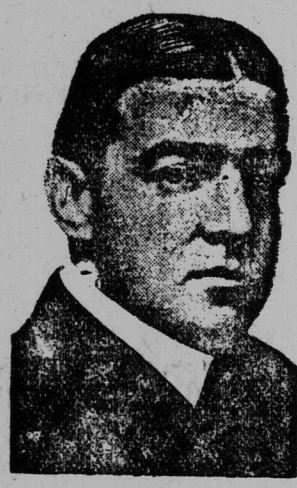
THE LATE SIR ERNEST SHACKLETON