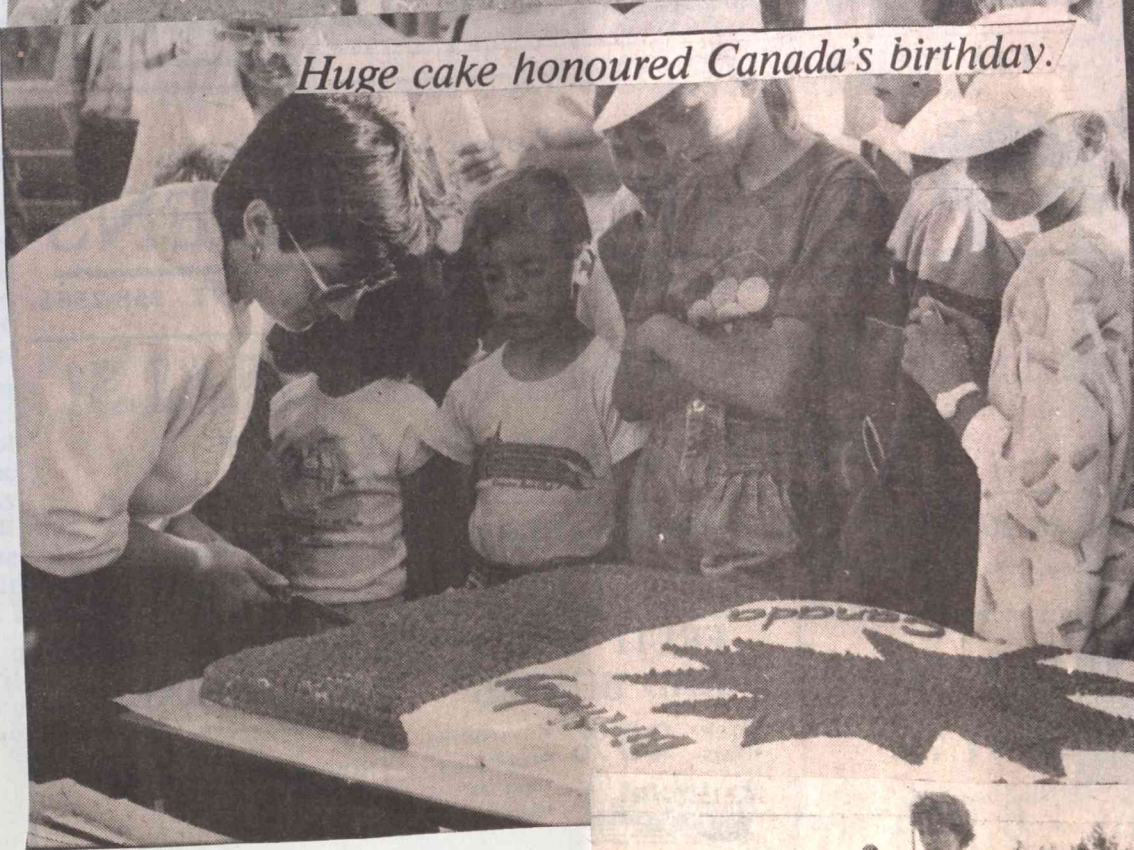
Huge cake honoured Canada's birthday.

50 children could be seen on the field kicking soccer balls and enjoying the evening. The next event featured a Tug-Of-War between 4-H groups. The might was shown by the Dairy Group, who managed to out-muscle their rival team. Throughout the evening, children had a chance to put on a happy face, via the face painting event. Organizers estimate that about 600 youths had their faces painted during the course of the evening. Over 500 children registered their names to participate in the balloon send-off with about 600 free treats of chocolate milk and ice-cream sundaes passed around to hungry kids. The bed-races drew a large crowd as five local teams pushed their bed-buggies around a portion of the track. The winner of the contest was the team of the Mountain Trailblazers. Many of the treats and ribbons presented to families were the result of donations from local service clubs, churches and Mountain Township. Events which drew participants to the Fifth Annual celebrations during the day included, harness racing, a horse show and a ball tournament. No details were available concerning the outcome of a number of the events, so check next week's Weekly Advance for the complete results.