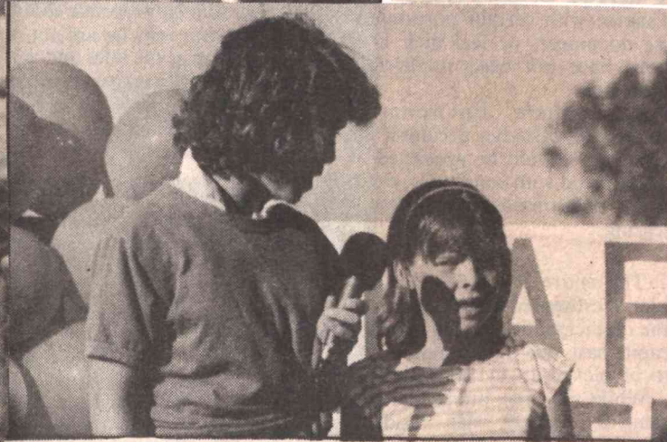
Leading the singing of O' Canada.