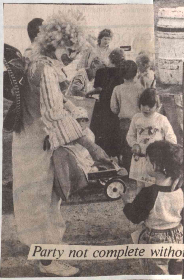
Party not complete without clowns.