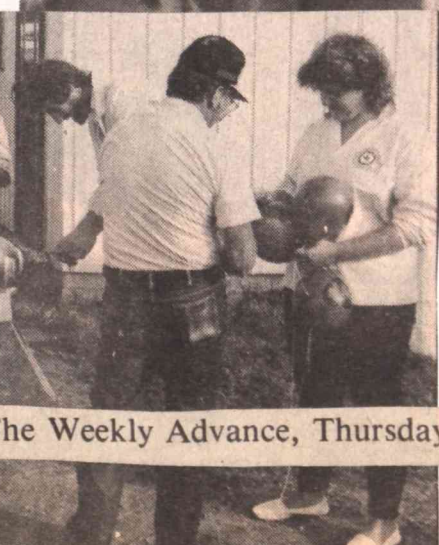
The Weekly Advance, Thursday, July 2, 1987