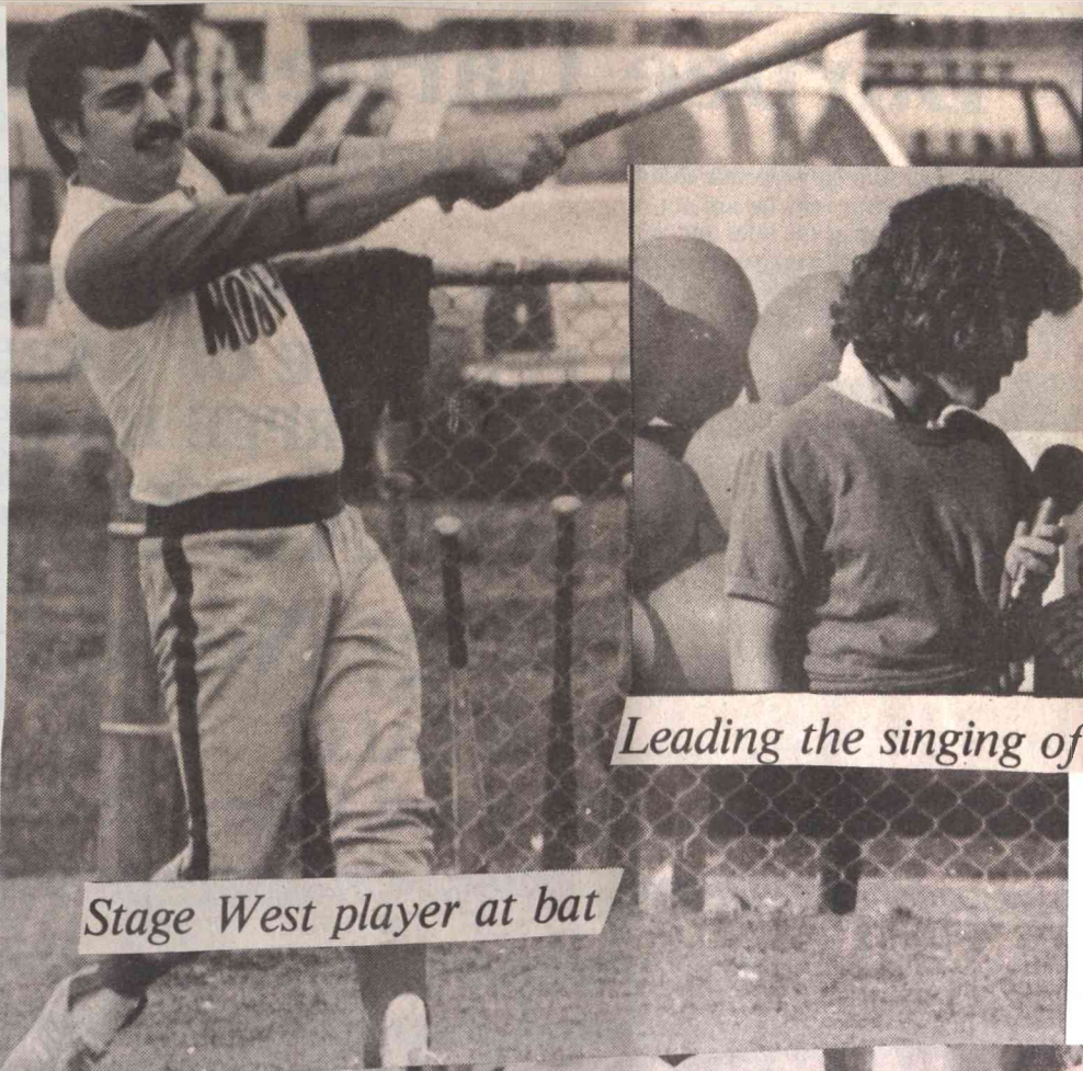
Stage West player at bat