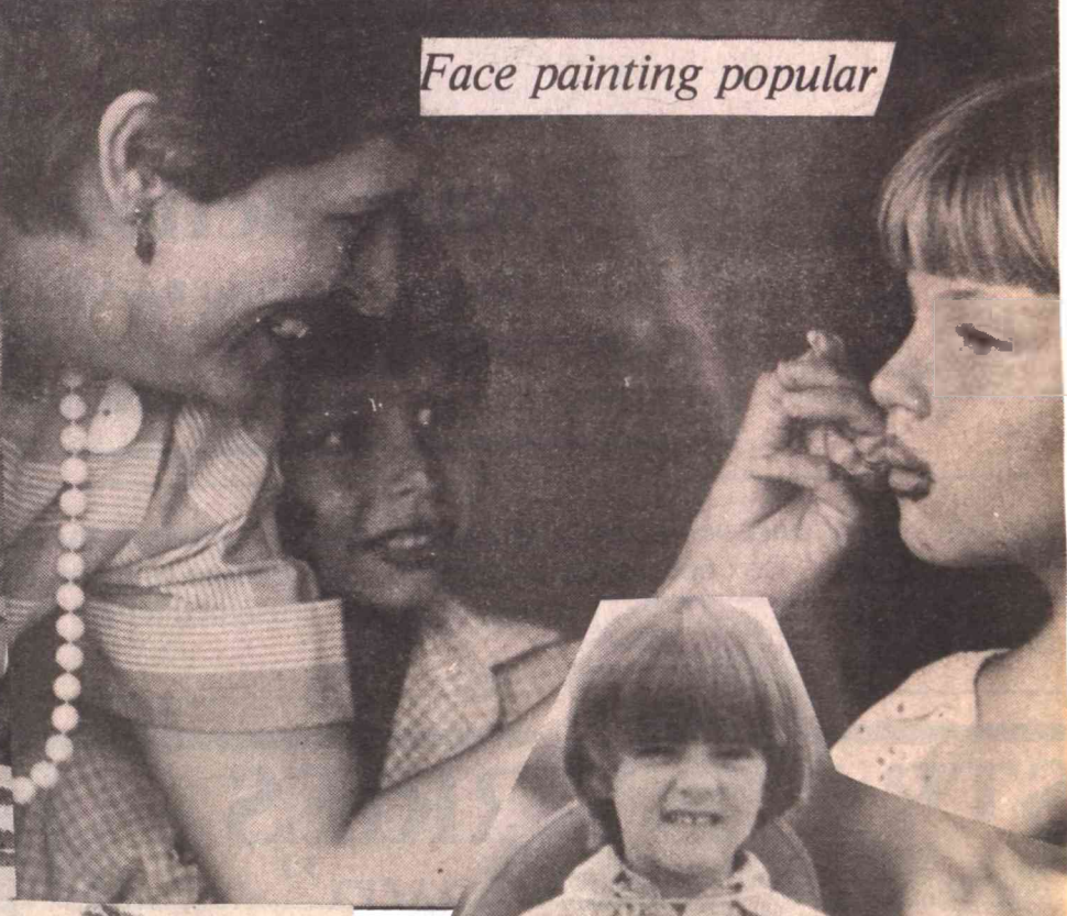
Face painting popular