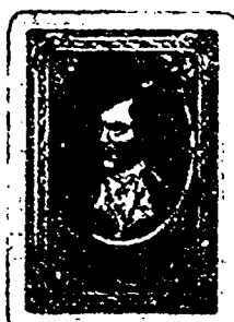
Burns, Dickens, Shakespeare