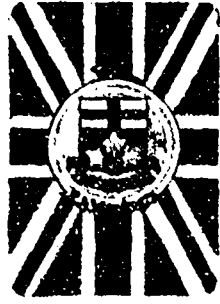
Union Jack, all the Provinces