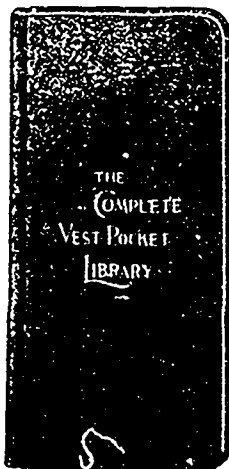
SIZE 5 1/2 X 2 1/4 INCHES

PRICES: Leather Gilt Indexed 50c. Cloth 25c.