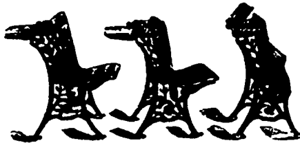
THE "MARVEL" SCHOOL DESK,

W. STAHLSCHEIDT & CO., PRESTON, ONTARIO, Manufacturers of Office, School, Church, and Lodge Furniture.