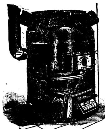
The "Economy" Warm Air Furnace.