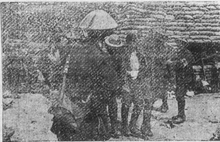
Wounded in the Trenches—Official Film, "Battle of the Somme."

MR. N. W. ROWELL, K.C., Leader of the Opposition.