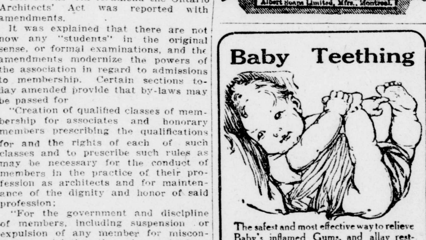
Doctor STEDMAN'S TEETHING POWDERS

These powders are guaranteed by the Proprietor to contain no harmful ingredient and have been used the world over for more than 60 years with great success in all infantile disorders arising from Teething See the Trade Mark A Gum Lancet on Every Packet