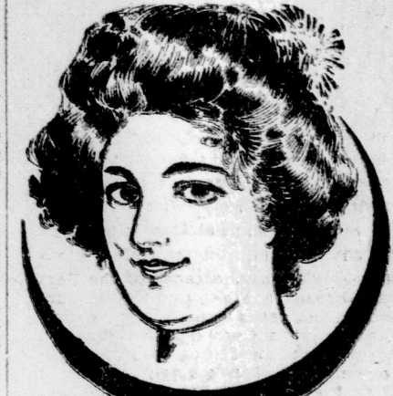
Beauty and Good Digestion Go Hand in Hand. Stuart's Dyspepsia Tablets Insure Both.

Quick Relief. Costs Nothing to Try. The man who can't help making faces at his stomach, the man or woman with a gurgly brash, or with downright dyspepsia need not be any more over stomach troubles. The heaviest, richest dinners, all can be taken care of without imposing on the stomach. A scientific digestive can do the digesting, where the stomach either did not do it before, or did it very imperfectly.