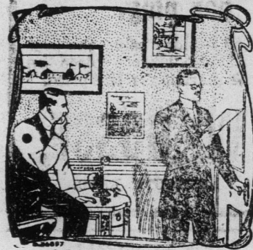
THE WHOLE STORY

of what our "Safeguard" method of Filing and Finding will do for you is told in a nutshell. It will keep you out of many a hole by ensuring immediate handling of every paper of your records when reference to them is imperative—and loss of them is disastrous.