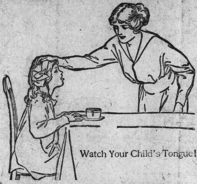
Watch Your Child's Tongue!