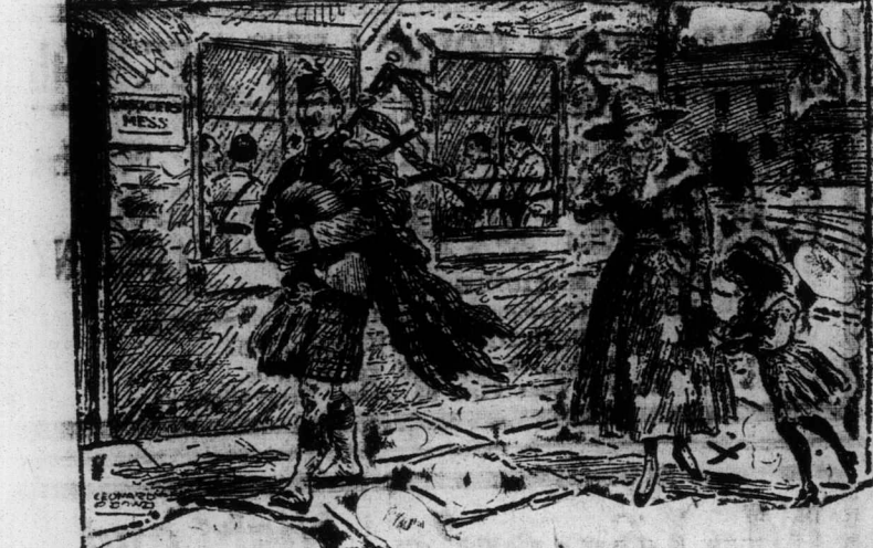
(Scene: Piper playing outside the officers' mess during dinner). Little Girl: "Do give the poor man a penny Mummy."—London Opinion.