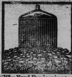
Why Ford Predominates

A dentist is about the only man who can tell a woman to shut her mouth and get away with it.