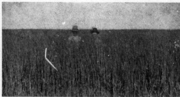
They are fully justified in the resulting crop.

Like many others we bought our tractor chiefly for threshing