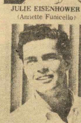
JEB MAGRUDER (Richard Beymer)