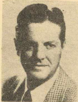
H. R. HALDEMAN (Robert Cummings)

So I began canvassing the best minds of my generation with the best Kohoutek-like brilliance, and the results follow. But first, a word to both those sharpies at Parker Brothers who might be tempted to make an incur-