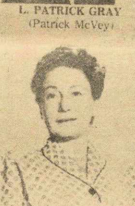
DITA BEARD (Thelma Ritter)