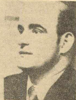
JOHN ERLICHMAN (Peter Boyle)

"When movie rights to 'All the President's Men' were bought, I thought of casting the 'Watergate Scandals.'"