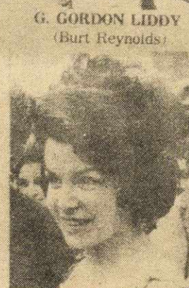
JULIE EISENHOWER (Annette Funicello)