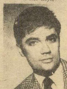
RON ZIEGLER