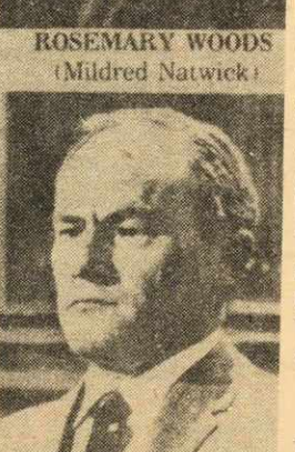
CONGRESS AND SENATE (E. G. Marshall)

Charles Colson: Simon Oakland or Marvin Kaplan, who used to read poetry on the old "Meet Millie" show