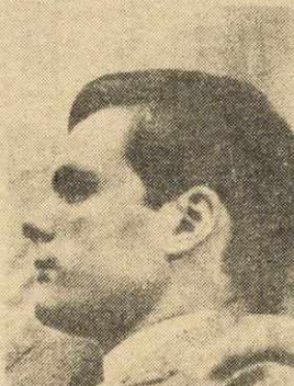
JOHN DEAN (Keir Dullea)