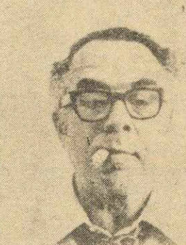
HENRY KISSINGER (Art Buchwald)