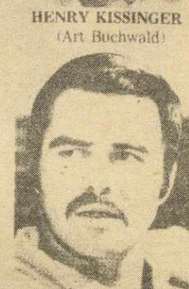
G. GORDON LIDDY (Burt Reynolds)