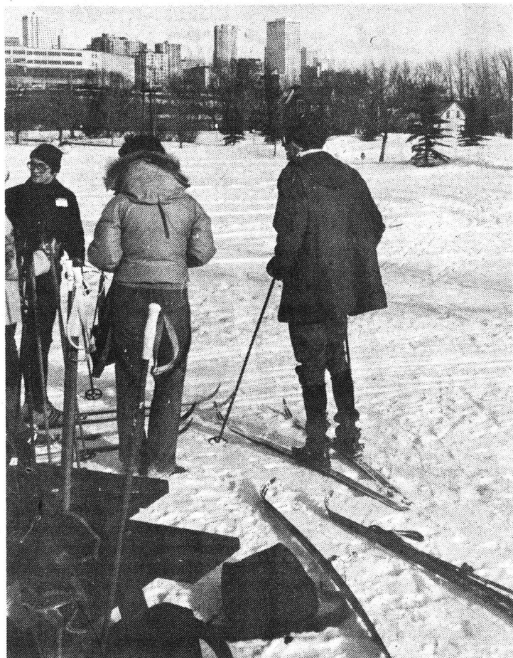
All kinds of skiers have been showing their stuff lately. Last weekend it was the Nordic Ski Club and this Saturday the downhillers get their chance in intramural races at Rabbit Hill.

Lastly in the women's world, here is a chance for some units to pick up on some missed participation points. The women's office will be sponsoring a run for women called "The Spring Run-Off" so be sure to watch for further details as they have not all been finalized as of yet.