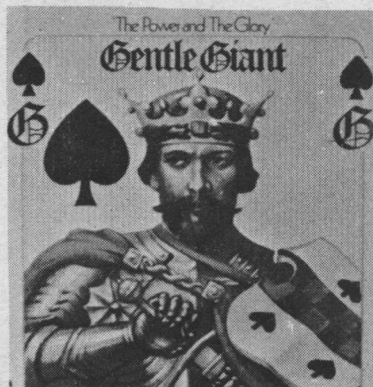
The Power and the Glory . Gentle Giant

Gateway reviewers have looked through their stacks of records and selected a few which you might consider purchasing for yourself or a friend over the Christmas holidays.