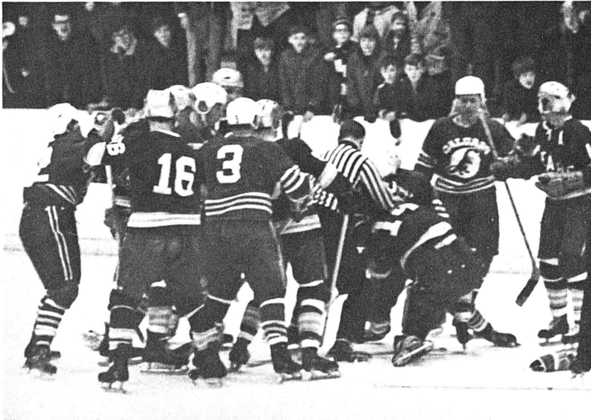
NOBODY COULD DENY THE ABUNDANCE OF ACTION ... in last weekend's Bear-Dinnies tilts